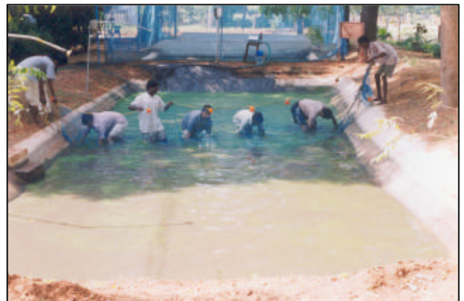
Brood fish collection

⇒ Brood fish nutrition Quality and quantity of feed as well as feeding regime are important for spawning and egg quality. A suitable package of diets using chicken intestine (70% protein) followed by fish waste (56% protein) and beef liver (63% Protein) was suggested for a maximum spawning of more than 6000