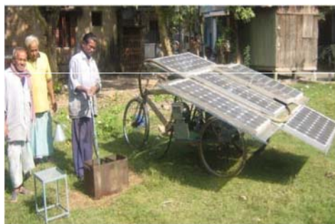
Multi-purpose portable solar pump system developed by NBIRT, Tripura