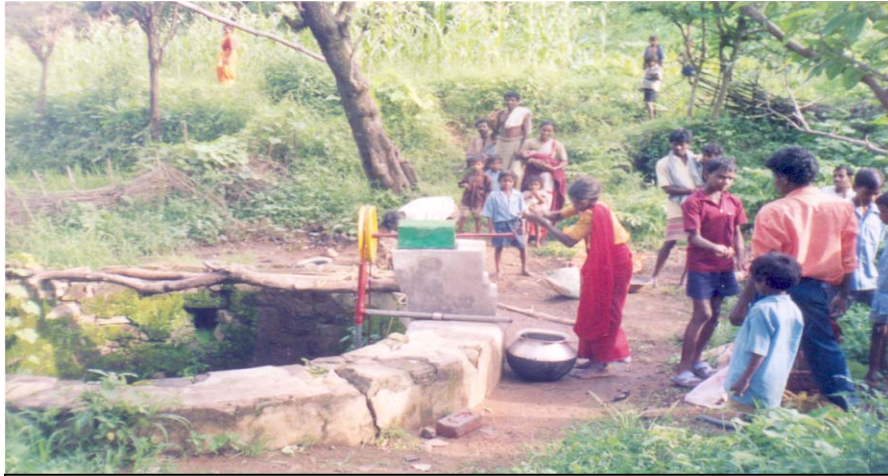
Cost-effective improved water lifting system (capacity 30-35 liters/min) using Plastic Washer Pump designed and developed by Society for Rural Industrialization, Ranchi.